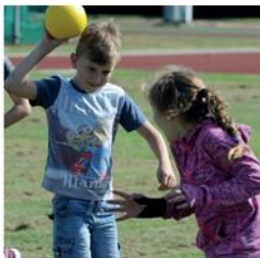
4. Pop Up Sports Clubs