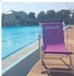
1. Lido summer season performance