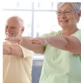
3. Cancer Rehabilitation Programme