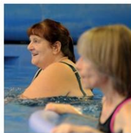
2. St George's Hydrotherapy Pool