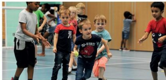
5. Club Viva